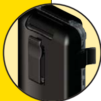
Armor 2600 Belt Clip