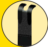
Armor 2600 Replacement Hand Strap

Enter or retrieve data while your PDA is in this tough case. Armor 2600's rugged reinforced ABS plastic protects your PDA from dirt, water, shock or impact. Waterproof and crushproof, Armor 2600 is perfect for military, industrial, emergency services, outdoor sports, airline, automotive, hunting or other harsh environments.