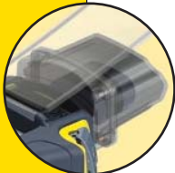
Armor 3600 CF POD