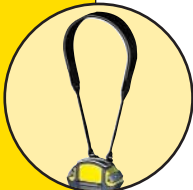
Armor 3600 Neck Lanyard Kit