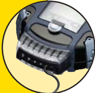
Armor 3600 Through-the-Box Connectivity Kit