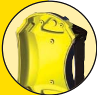
Armor 3600 Deep Box Kit with Handstrap