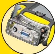
Armor 3600 Serial POD Kit