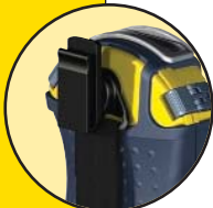
Armor 3600 Belt Clip

Use any PDA while it's in the Armor 3600. Protect your PDA from harsh environments: dirt, water, sand, snow, rain, humidity, shock and impact. Through-the-Box connectivity allows waterproof cable connections to external GPS, power supplies, printers and more.