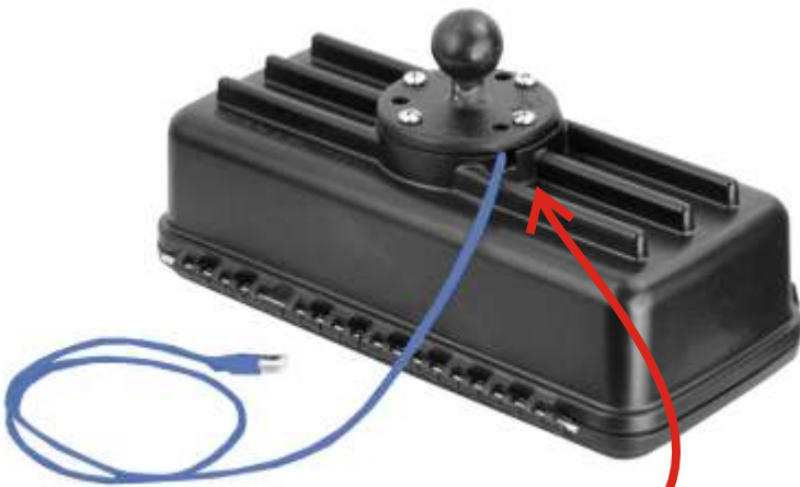
Run Electric Cord Then Fasten Base